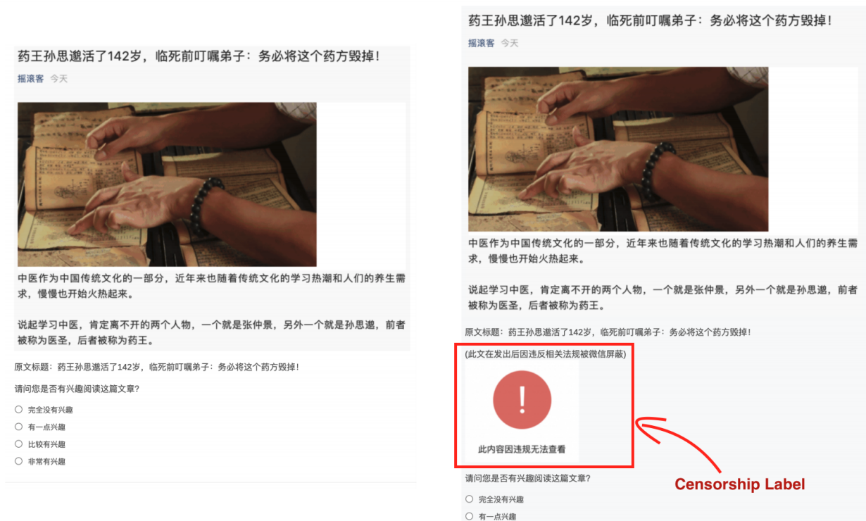
Figure 2: Example Article Snippet with and without Censorship Label (The Red Exclamation Mark) in the Experiment

Notes: The censorship label reads: This article was blocked by WeChat due to violation of Internet law.